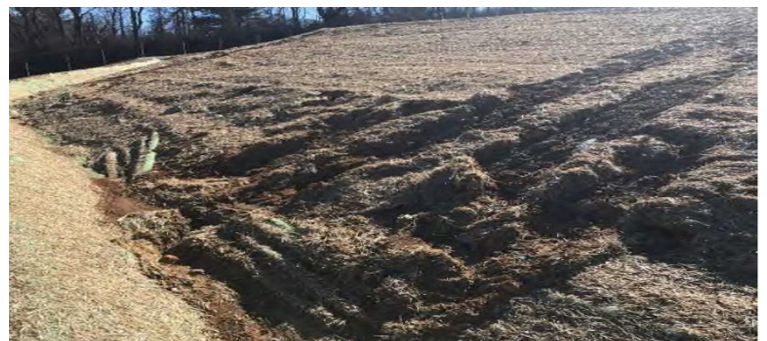
Erosion on slope decreases capacity of ditch at Caden Energix Wytheville, SWVA DEQ inspector's report